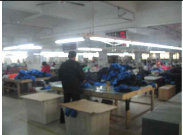
28) Packaging room