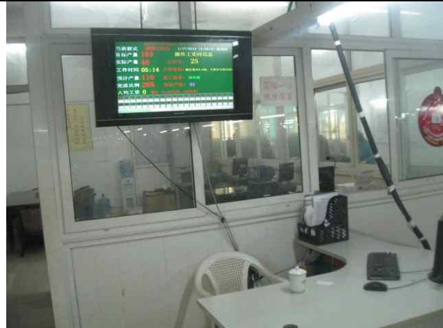
45) QC room