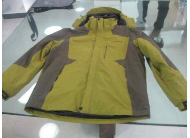
52) Similar product