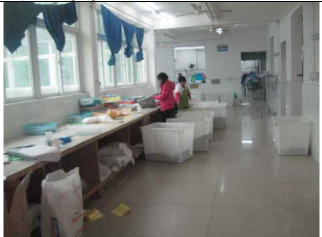
48) Packaging room