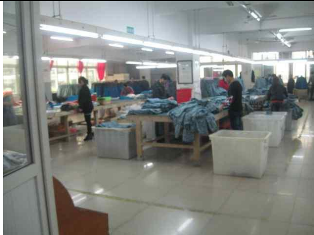
27) Packaging room