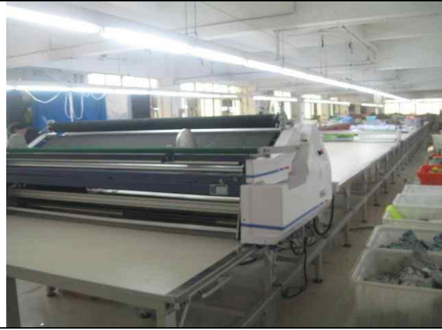
37) Computerized marker