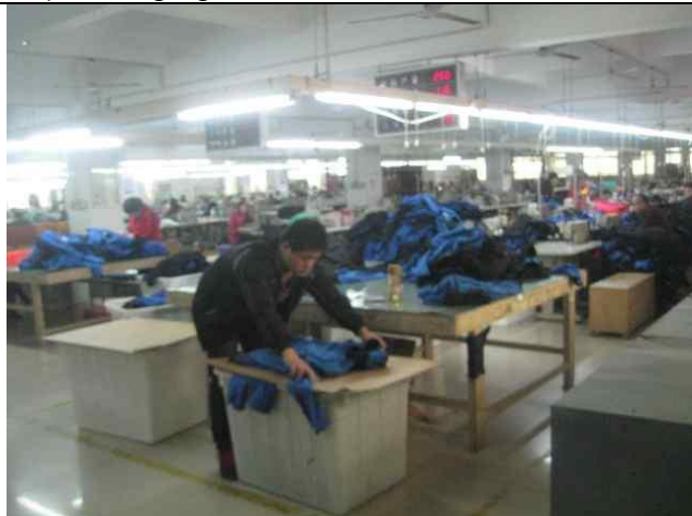
29) Packaging room