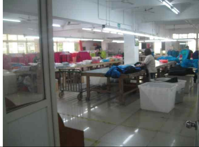
33) Packaging room