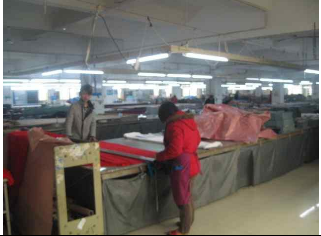
34) Cutting room