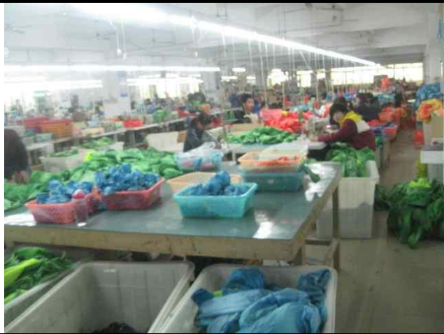
25) Production line