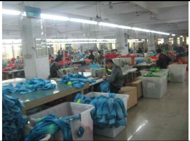
26) Production line