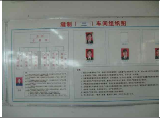
32) Production plate