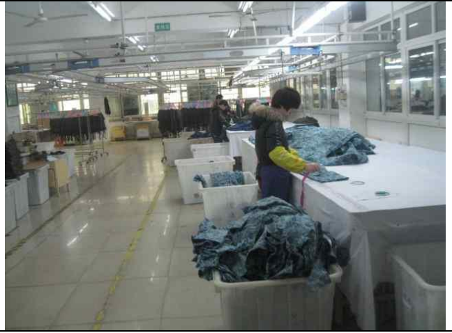
20) Packaging room