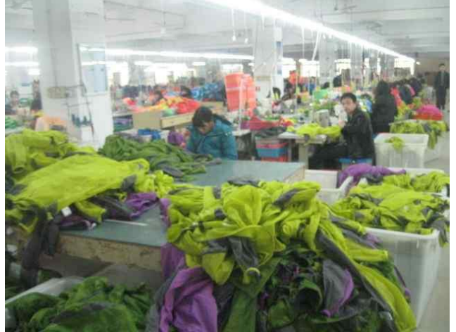
24) Production line