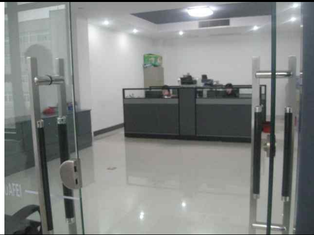
7) Administration Department