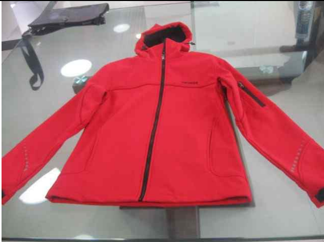
49) Similar product