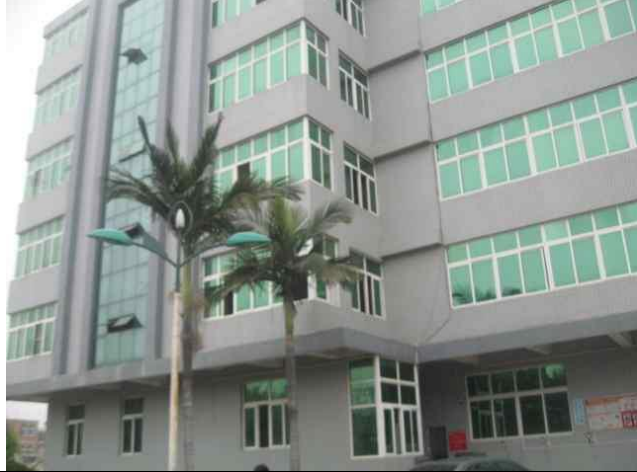
15) Workshop buildings