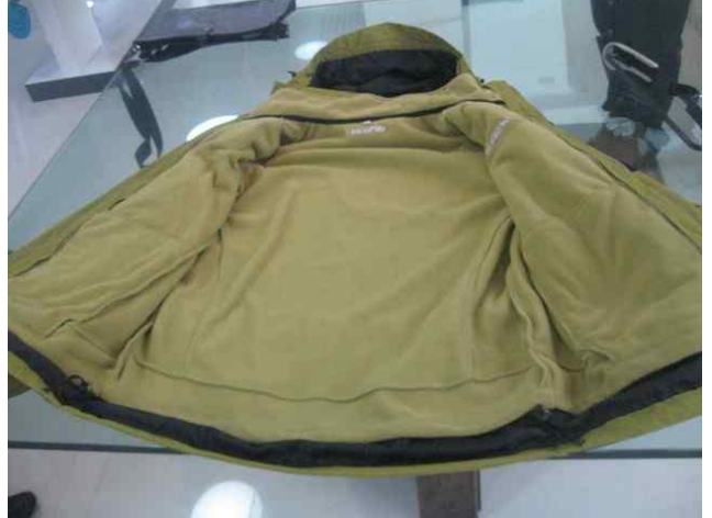
54) Similar product