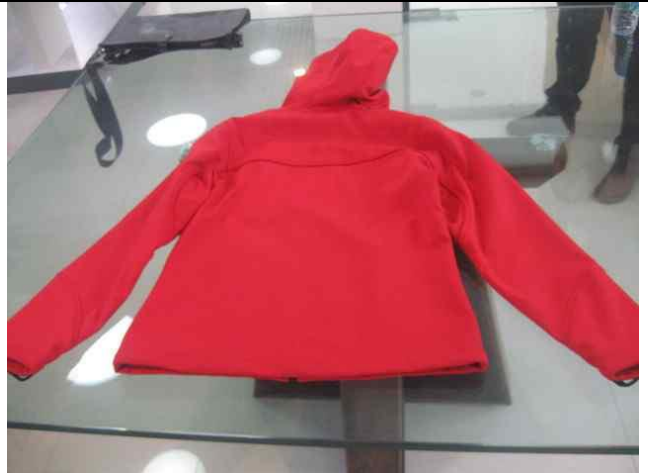
50) Similar product