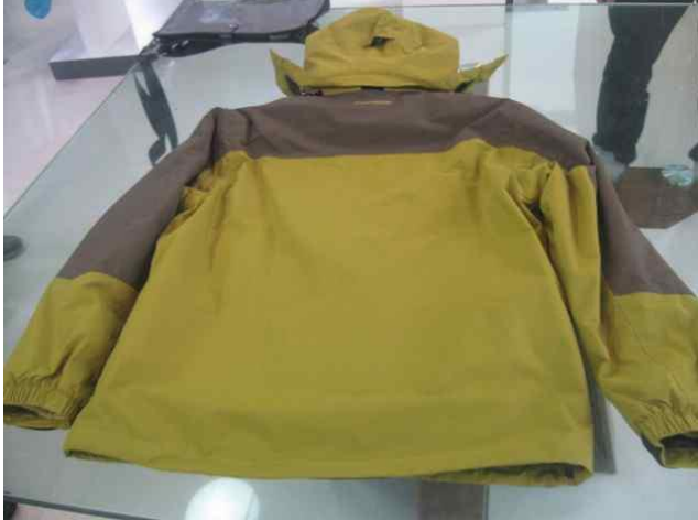
53) Similar product