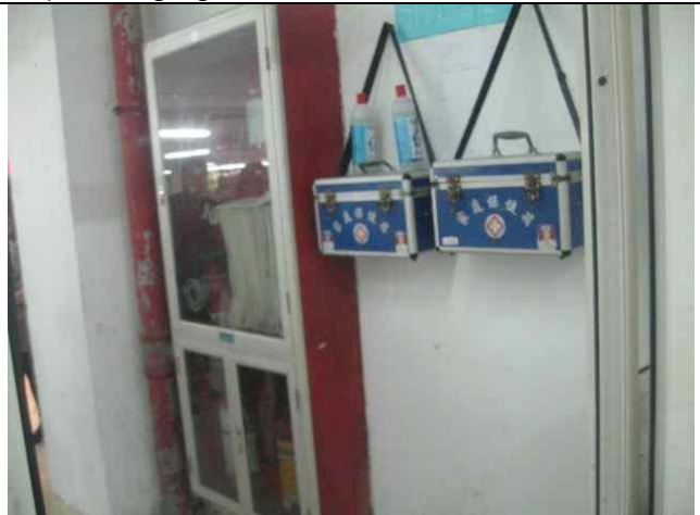
30) Medical kit