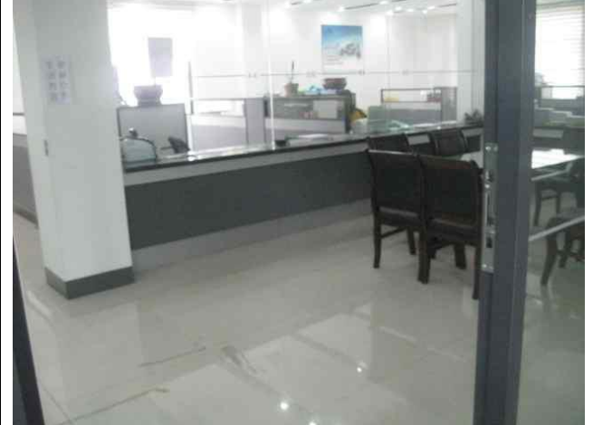
10) Reception rooms