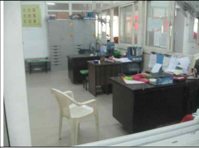
19) QC room