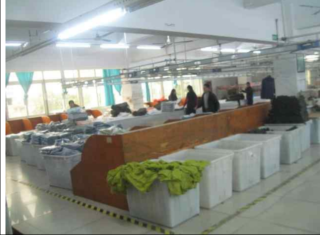
21) Packaging room