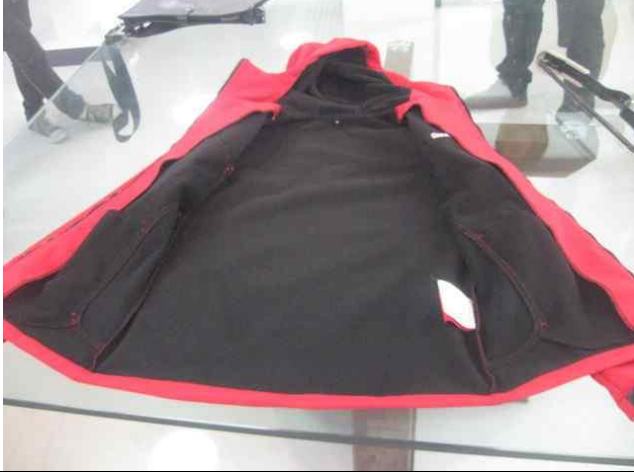
51) Similar product