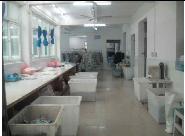
46) Packaging room