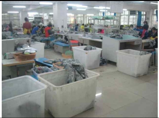
44) production line