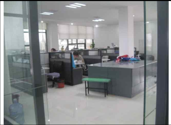
8) Sales office