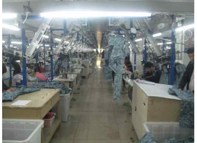
18) Semi-automatic production line