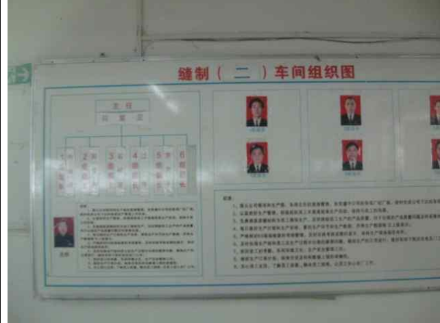
23) Production plate