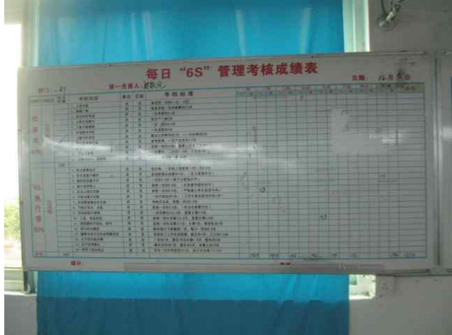
17) Production plate