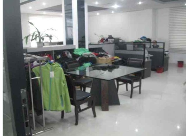
9) QC office